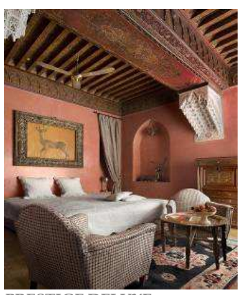
PRESTIGE DELUXE - 35 à 40m<sup>2</sup>