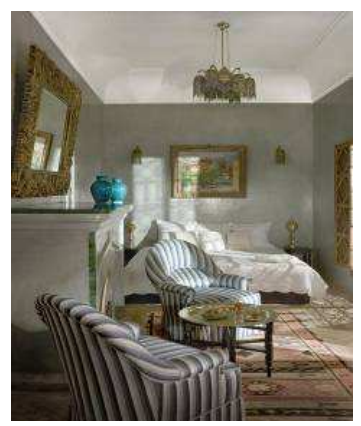
PRESTIGE - 30 à 40m<sup>2</sup>