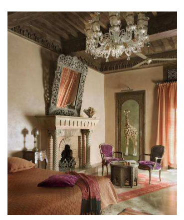
JUNIOR SUITE DELUXE